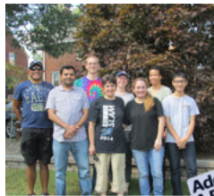
EBA & Friends

As many of our regular readers know, EBA is giving back to the community by sponsoring Sligo Ave through the Adopt-A-Road program. EBA staff and friends took to the streets again to battle the trash and litter, and we had a lot of fun doing it! For more information about the program, visit the MCDotT page at : http://bit.ly/MCdotadoptaroad