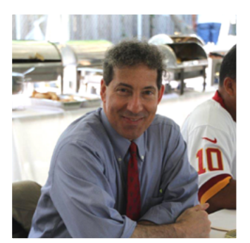
Maryland State Senator Jamie Raskin